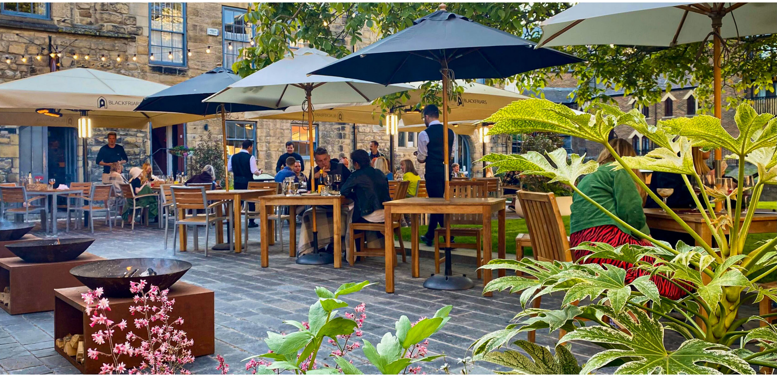
Blackfriars Cloister Garden - Newcastle